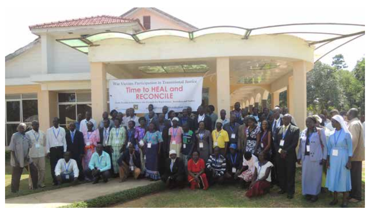
From victims to survivors: the struggle for Reparations, Remedies and Justice Participants in the Greater North War Victims' Conference at Lira hotel, November 2013